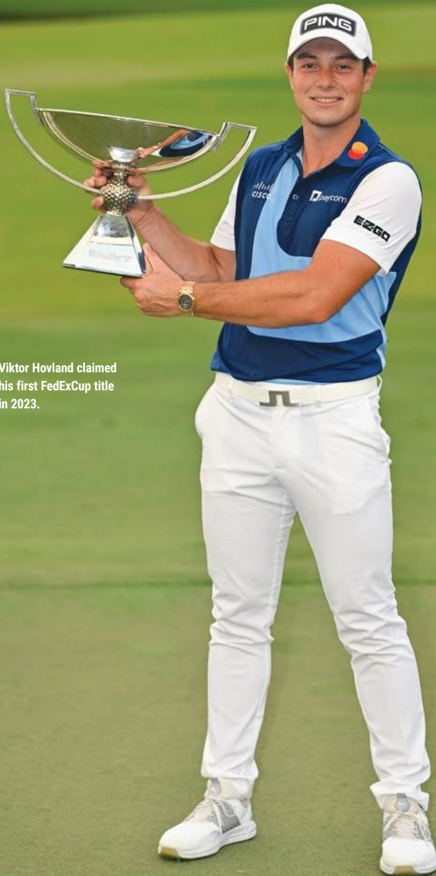
Viktor Hovland claimed his first FedExCup title in 2023.